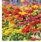
ZINNIA, State Fair Mix (Zinnia elegans)