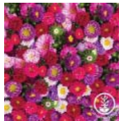
ASTER, Powderpuff Mix (Callistephus Chinensis)