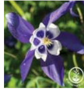
COLUMBINE, Colorado Blue (Aquilegia Coerulea)