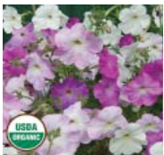
PETUNIA, Old-Fashioned Vining (Peturnia multifora)