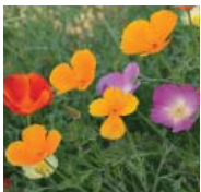
POPPY, California Mix (Eschscholzia californica)