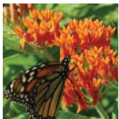
BUTTERFLY WEED (Asclepias tuberosa)