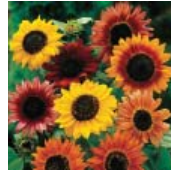
SUNFLOWER MIX (Helianthus annuus)