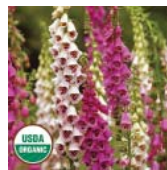
FOXGLOVE, Giant Spotted (Digitalis Purpurea)