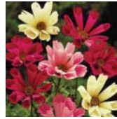
COSMOS, Seashell Mix (Cosmos bipinnatus)