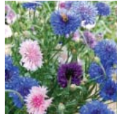
BACHELORS BUTTON MIX