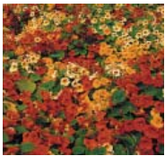
NASTURTIUM, Tip Top (Tropaeolum minus)