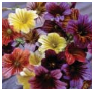
PAINTED TONGUE (Salpiglossis sinuata)