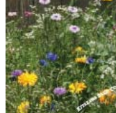
EDIBLE FLOWER MIX