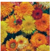
CALENDULA MIX (Calendula officinalis)