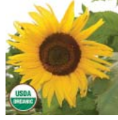
SUNFLOWER, Akira (Helianthus annuus)