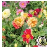
DAHLIA, Figaro (Dahlia pinnata)