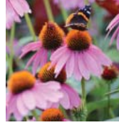
CONEFLOWER, Purple (Echinacea purpurea)