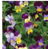
JOHNNY JUMP UP (Viola cornuta)