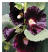
HOLLYHOCK, Black (Alcea rosea)