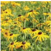
BLACK EYED SUSAN (Rudbeckia hirta)