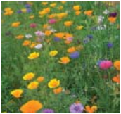
BIRD & BUTTERFLY MIX