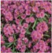
ASTER, New England (Symphyotrichum novae-angliae)