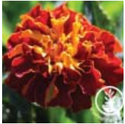
MARIGOLD, French Naughty (Tagetes patula)