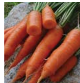
CARROT, Red Cored Chantenay ( Daucus carota )