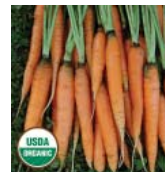
CARROT, Scarlet Nantes ( Daucus carota )