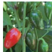
PEPPER, Georgia Flame ( Capsicum annuum )