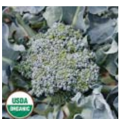
BROCCOLI, Calabrese ( Brassica oleracea )