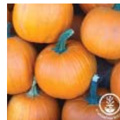
PUMPKIN, Jack Be Little ( Cucurbita pepo )