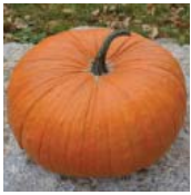
SQUASH, Cornfield Pumpkin) ( Cucurbita pepo )