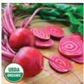
BEET, Chioggia ( Beta vulgaris )