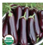
EGGPLANT, Diamond ( Solanum melongena )