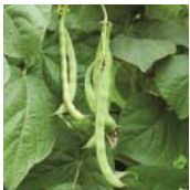
BEAN, Kentucky Wonder Pole ( Phaseolus vulgaris )