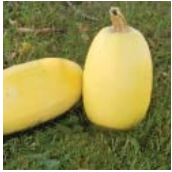
SQUASH, Spaghetti ( Cucurbita pepo )