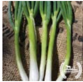
ONION, Bunching Evergreen ( Allium cepa )