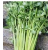
CELERY, Tall Utah ( Apium graveolens )