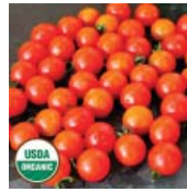
TOMATO, Currant Sweet Pea ( Solanum lycopersicum )