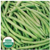
BEAN, Empress ( Phaseolus vulgaris )