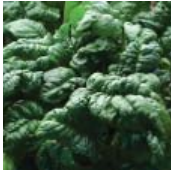
SPINACH, Bloomsdale ( Spinacia oleracea )