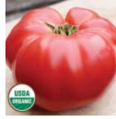
TOMATO, German Pink ( Solanum lycopersicum )