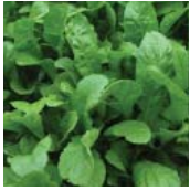
ARUGULA, Apollo ( Eruca Sativa )