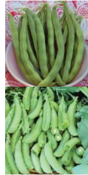
PEAS, Amish Snap ( Pisum sativum )