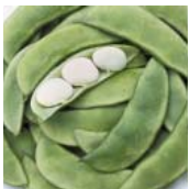
BEAN, Lima Bean Henderson Bush ( Phaseolus lunatus )