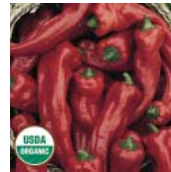
PEPPER, Bull Nose Bell ( Capsicum annuum )