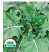
COLLARD, Ellen Felton Dark ( Brassica oleracea )