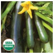
SQUASH, Black Beauty ( Cucurbita pepo )