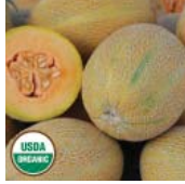
MELON, Sweet Granite ( Cucumis melo )