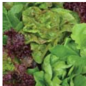
LETTUCE, Seed Savers Mix ( Lactuca sativa )