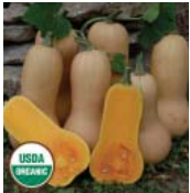
SQUASH, Waltham Butternut ( Cucurbita moschata )