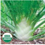
FENNEL, Florence ( Foeniculum vulgare )