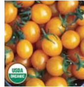
TOMATO, Blondkopfchen ( Solanum lycopersicum )