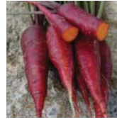
CARROT, Dragon ( Daucus carota )