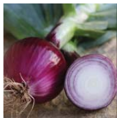
ONION, Ruby Red ( Allium cepa )