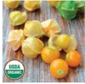
GROUND CHERRY ( Physalis grisea )