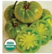
TOMATO, Tasty Evergreen ( Solanum lycopersicum )