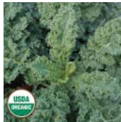
KALE, Dwarf Blue Curled ( Brassica oleracea )