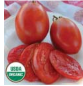
TOMATO, Amish Paste ( Solanum lycopersicum )