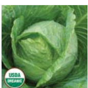
CABBAGE, Early Jersey Wake- field ( Brassica oleracea )