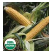
CORN, Golden Bantam ( Zea mays )