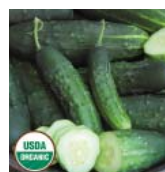
CUCUMBER, Early Fortune ( Cucumis sativus )