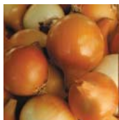
ONION, Yellow of Parma ( Allium cepa )