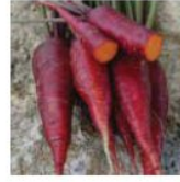
CARROT, Dragon ( Daucus carota )