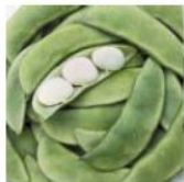
BEAN, Lima Bean Henderson Bush ( Phaseolus lunatus )