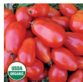
TOMATO, Martino's Roma (Solanum lycopersicum)