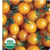
TOMATO, Blondkopfchen (Solanum lycopersicum)