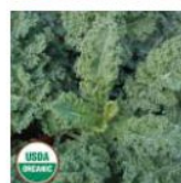
KALE, Dwarf Blue Curled ( Brassica oleracea )