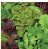
LETTUCE, Seed Savers Mix ( Lactuca sativa )