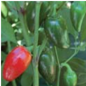
PEPPER, Jalepeno Traveler (Capsicum annuum)