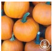
PUMPKIN, Sugar Pie (Cucurbita pepo)