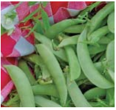
PEAS, Amish Snap (Pisum sativum)