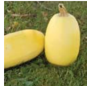
SQUASH, Spaghetti (Cucurbita pepo)