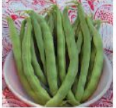
BEAN, Kentucky Wonder Bush ( Phaseolus vulgaris )