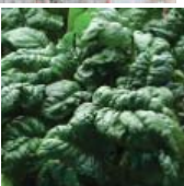
SPINACH, Bloomsdale (Spinacia oleracea)