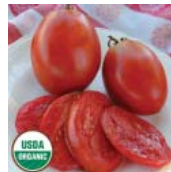
TOMATO, Amish Paste (Solanum lycopersicum)