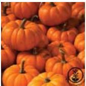
PUMPKIN, Jack Be Little (Cucurbita pepo)