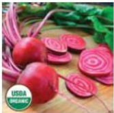
BEET, Chioggia ( Beta vulgaris )