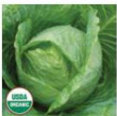
CABBAGE, Early Jersey Wakefield ( Brassica oleracea )