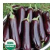
EGGPLANT, Diamond ( Solanum melongena )