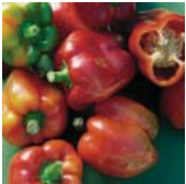
PEPPER, Bull Nose Bell (Capsicum annuum)