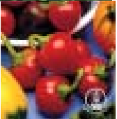
PEPPER, Sweet Red Cherry (Capsicum annuum)