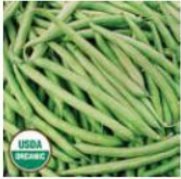
BEAN, Empress ( Phaseolus vulgaris )