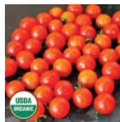
TOMATO, Currant Sweet Pea (Solanum lycopersicum)