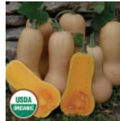
SQUASH, Waltham Butternut (Cucurbita moschata)