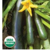
SQUASH, Black Beauty (Cucurbita pepo)