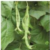
BEAN, Kentucky Wonder Pole ( Phaseolus vulgaris )