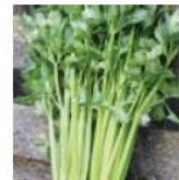
CELERY, Tall Utah ( Apium graveolens )