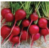
RADISH, Early Scarlet Globe (Raphanus sativus)