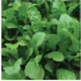
ARUGULA, Apollo ( Eruca Sativa )