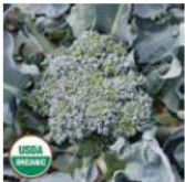
BROCCOLI, Calabrese ( Brassica oleracea )