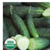
CUCUMBER, Early Fortune ( Cucumis sativus )