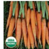
CARROT, Scarlet Nantes ( Daucus carota )