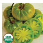
TOMATO, Tasty Evergreen (Solanum lycopersicum)